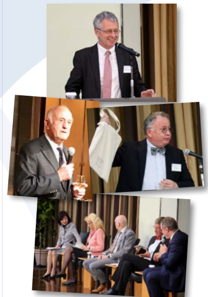
Several warm welcome messages and a panel discussion were part of the DIJ's anniversary event

Heisei Japan is entering its 30th year in 2019. The era will end on 30 April 2019 when Emperor Akihito will officially step down. Both speakers also talked about Japan's changing role in the world as well as similarities and remaining differences with Germany. The seminar, which was organized on the initiative of Dentsu and on the occasion of the DIJ's own 30th year of history, attracted an audience of about 100, mainly Japanese participants. — F.W.