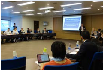
Participants at the joint Big Data workshop in November

Internet platforms are an important source of big data. While the leading global platforms are headquartered in the US, Japan, too, hosts some strong players due to its large and advanced domestic market. Two of them presented their big data strategy at the workshop. Rakuten, Japan's leading e-commerce business, uses the huge volume of data generated by their customers to quickly capture new market developments, enhance user experience, and to offer tailor made product and service solutions. Bengo4.com, Japan's largest and fast-growing online legal consulting platform applies big data analytic tools to improve the matching of inquiries with existing legal databases and to automate parts of its consulting work. Its success